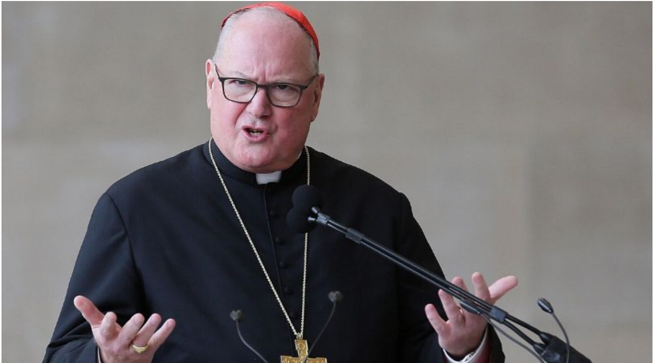
Cdl. Timothy Dolan