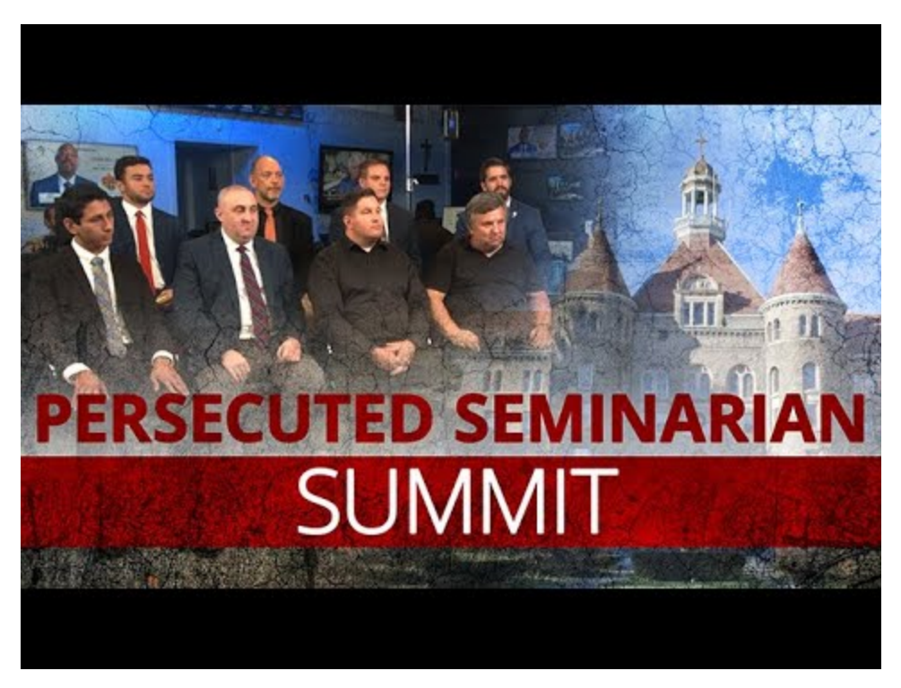
Watch Video At: https://youtu.be/Xck53kmVM9Y

Interestingly, these allegations come in the wake of reports that enrollment at the NAC is said to be approximately half, today, of what it was in 2016, when Harman became the rector.